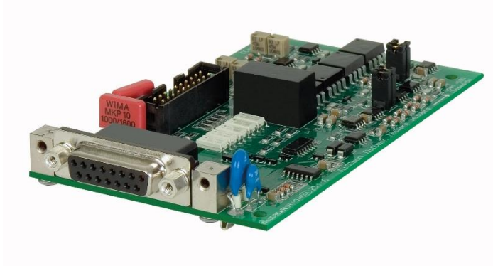
Card for inserting in power supply