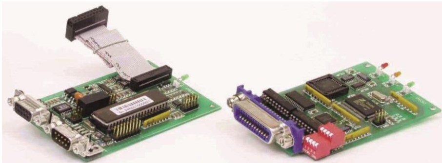
Card for inserting in power supply