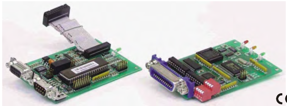
Internal PSC card