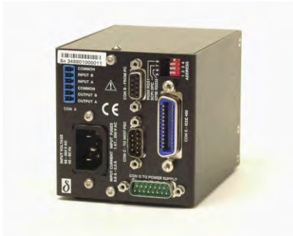
External PSC module